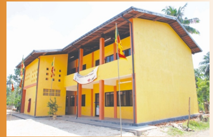
One of the Preschool buildings

Caritas Sri Lanka(CSL)- SEDEC is not only involved in providing shelter in the North, but also schools, in the South. On February 15, 2008 Caritas SEDGalle in collaboration with CSL-SEDEC and other Implementing Partners handed over two-storey classroom buildings for two Tsunami affected schools in Galle and Hikkaduwa.