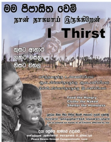
Lenten Poster - 2008

Ash Wednesday, February 6, 2008 marked the beginning of the Lenten season. During Lent, Catholics reflect upon the suffering of Jesus Christ through prayer, fasting and penance in order to celebrate the Resurrection of Jesus Christ on Easter Sunday.