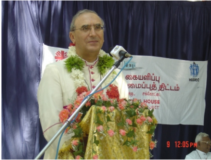
Apostolic Nuncio addressing the crowd

Amidst the turmoil and war situation, there was a smile upon the faces of Sakodai and Munai when Caritas Jaffna-HUDEC in collaboration with Caritas Sri Lanka(CSL)-SEDEC and other implementing Partners handed over keys to new houses in Jaffna. A total of 96 houses at Munai and 57 houses at Sakkodai in Point Pedro were handed over on January 9, 2008.