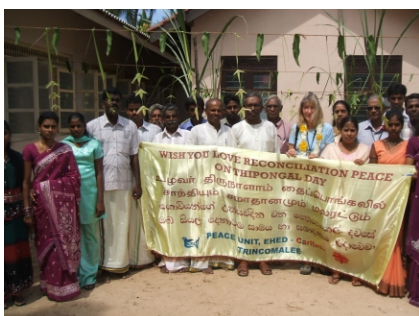
Celebrating a day of peace and reconciliation

Caritas Trincomalee - EHED in collaboration with the divisional staff of Kuchchaveli celebrated Thai Pongal with people from surrounding communities on January 25, 2008 at the Valaiyoothu Community Health Centre, Trincomalee. The inter-religious