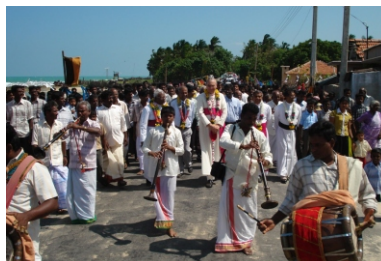
The distinguished guests being welcomed