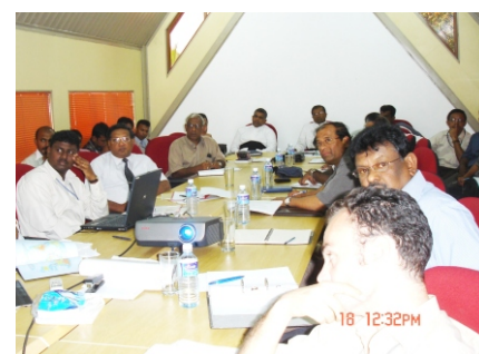
Some of the CSL-SEDEC and Diocesan Staff at the OD process

We thank all CSL Partners at all levels who have joined hands in solidarity to make this effort a success. Regular updates of the OD process will be informed to Caritas Partners and Stakeholders.