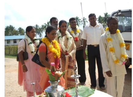
The distinguished guests at the ceremony

Centre of CSL - SEDEC expressed their commitment to protect the rich heritage of Sri Lanka and promote peace and harmony among all people.