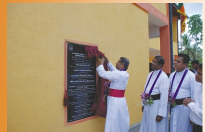
The Chief guest unveiling the plaque in one of the schools

Caritas Sri Lanka(CSL)- SEDEC is not only involved in providing shelter in the North, but also schools, in the South. On February 15, 2008 Caritas SEDGalle in collaboration with CSL-SEDEC and other Implementing Partners handed over two-storey classroom buildings for two Tsunami affected schools in Galle and Hikkaduwa.