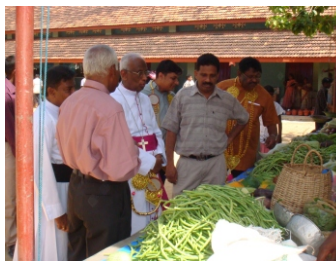
The distinguished guests at a stall