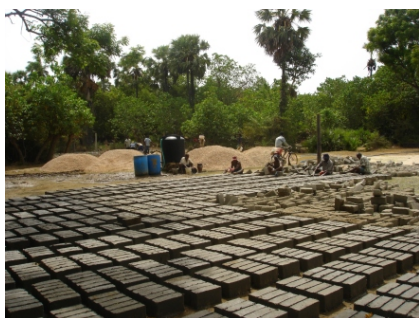
The 3000 bricks produced each day

A mass production of brick making takes place in Jaffna in spite of the ravaging war in the North.