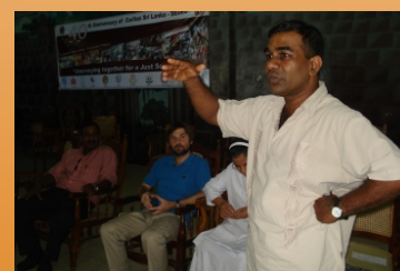
Gender Sensitivity and Protection workshop

The main objective of the workshop was to identify the ground situation of the women and children in the IDP camps who are affected by war and to find ways and means to ensure their protection. 25 staff members from the Diocesan Centres of Jaffna, Mannar, Batticaloa and Trincomalee; working in the field of Relief and Rehabilitation, participated in the event along with the Women's desk and R&R staff from the National Centre.