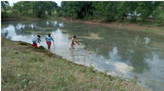
Cleaning the Asirigama pond by the CBO members