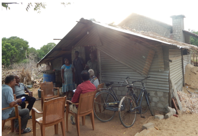
Temporary shelter built for the Indian returnee family

Most of the beneficiaries who were displaced to India are returning to their home country. Since the 2nd and 3rd generation families are also returning from India, they don't own land to construct houses. Therefore, the Government provided land for the refugee returnees and the National Housing Development Authority provided money to construct houses on an installment basis. However, due to their poor economic condition community-based organizations