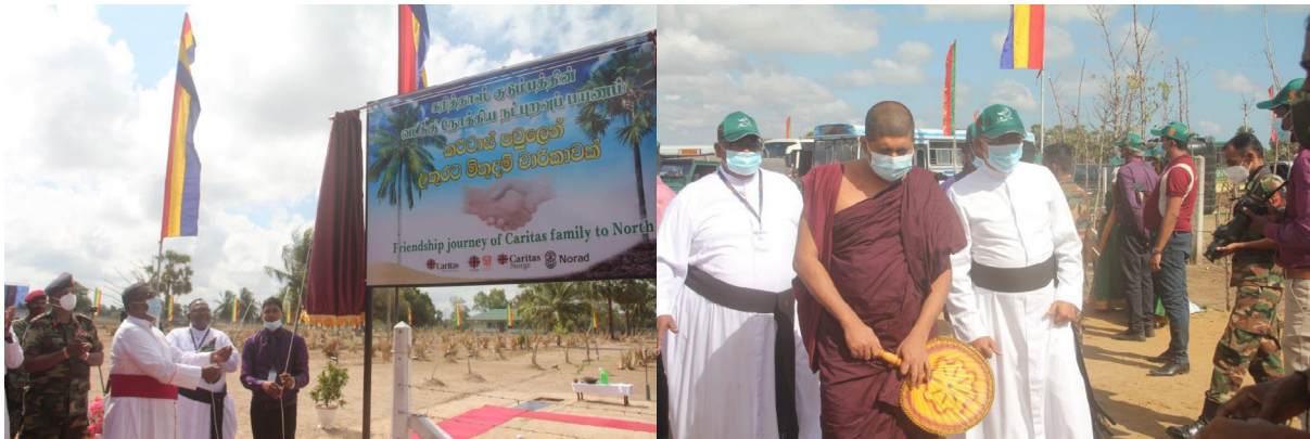
Tree Planting campaign at Jaffna