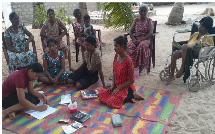
PwD group meeting

In the Vanni district, the present Government transferred responsibility of civil administration to the Ministry of Defense, including the government's response to the Covid-19 pandemic. The government has rapidly expanded the role of the military by appointing several retired officers to civil leadership roles and creating task forces.