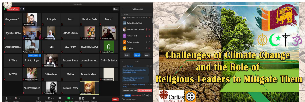
Virtual Workshop on Climatic Change