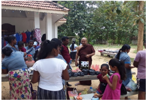
Focussed group discussions at a Chilaw CBO