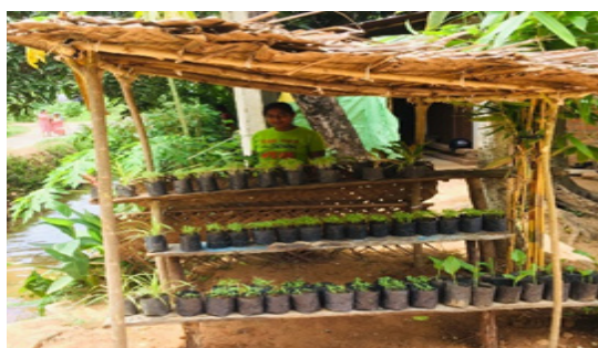
Plant Nursery at Caritas Anuradhapura