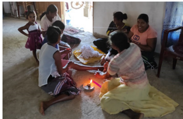
Making of cotton wicks