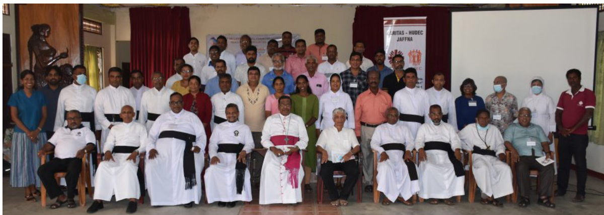
Jaffna Peace Forum with Church actors

The Jaffna Forum, the second phase of the National Forum for Church Actors on Peace and Reconciliation in Sri Lanka, came to a close with a solid understanding that continuation of such fora to provide space for dialogue and to foresee a tangible outcome for continued dialogue, among a greater number of peace actors is possible through the togetherness of all related actors. Caritas Sri Lanka – SEDEC and the diocesan centres have created a roadmap for such fora, where phase 3 being the next step, would target a wider religious community for progressive dialogue.