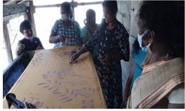
At the Coir and Batik production