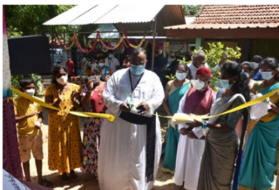
Exhibition at Annakodai CBO