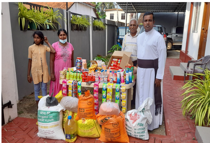
Livelihood assistance for a Small shop

Even after the war ended in 2009, the personal debt levels of local communities in the North and East are climbing sharply. A large number of microfinance institutions have opened for business in these areas. The availability of ready credit has driven many people into indebtedness. Because of the high interest rates, a large number of families are falling into steep debt, unable to pay back the loans. There is still a need to help these families to develop their livelihoods on a sustainable basis taking into account the prevailing market opportunities.