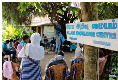
VKC at Mannar Diocese

The centres are equipped with internet facilities including Zoom / Viber / WhatsApp accessibility Display boards, a small library, a wired or wireless public address system, a Knowledge map, and Record keeping systems to provide dynamic information necessary to the villagers based on their agricultural needs. Currently, this knowledge dissemination approach has been grasped by the diocesan Food Security staff and has been promoted. Currently, 72 Village Knowledge centres have been established and the prospective farmers have been capacitated in agronomy and livestock development in target areas.