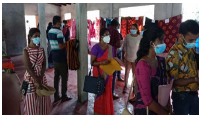
At the Batik Center