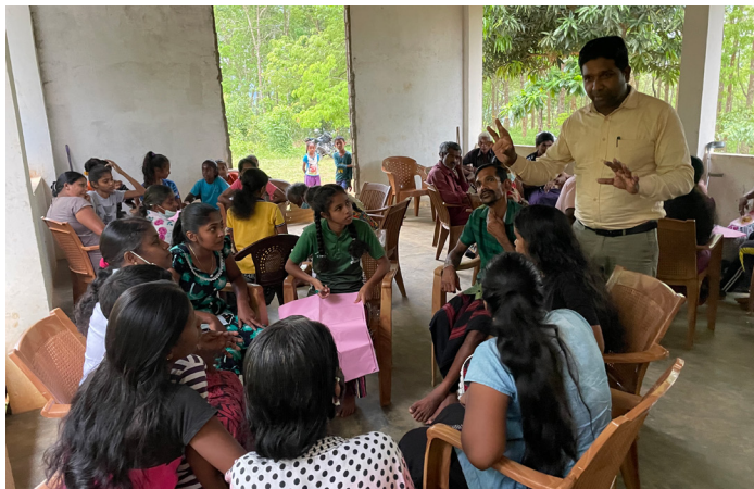
Training on Communication

The Program “Facilitating Green Gold Harvesters to Reap Maximum Benefits for Plantation Community” has been an effective and timely program for the people in the estate sector. The economic setting in the estate sector is another identified negative factor. The people are employed for a daily wage, which is insufficient to meet their daily needs. The number of kilograms of tea they pluck will also have an impact on their daily wages.