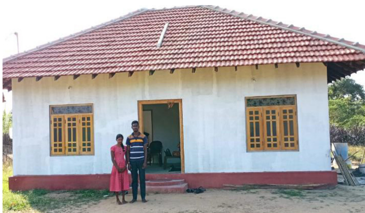
Completed house at Mullikulam

Even amid of Corona threats and lockdowns due to the economic crisis, the local authorities have given permitted for construction work to continue. Priority was given to newly married families who did not have separate houses. The rest of the houses will be completed by September 2022 and will be handed over to the community.