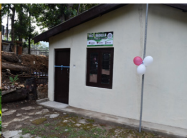
VKC at Badulla Diocese