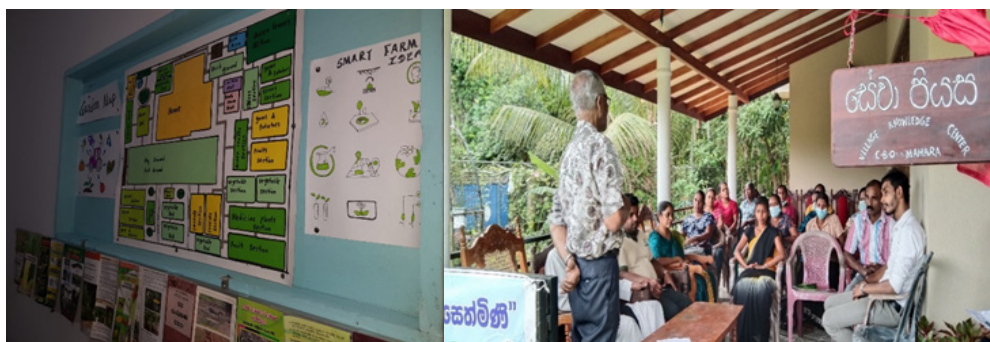
VKC at Ratnapura Diocese

Under the technical guidance of the funding Partner Caritas Norway/ Norad, Caritas Sri Lanka has introduced the concept of Village knowledge dissemination through the channels of centres and prospective farmers (village knowledge persons- VKP). The objective of VKCs is to harness the power of ICT for knowledge, skill, and economic and social empowerment of rural families based on the principle of reaching the unreached and voicing the voiceless.