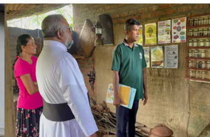
VKC at Chilaw Diocese