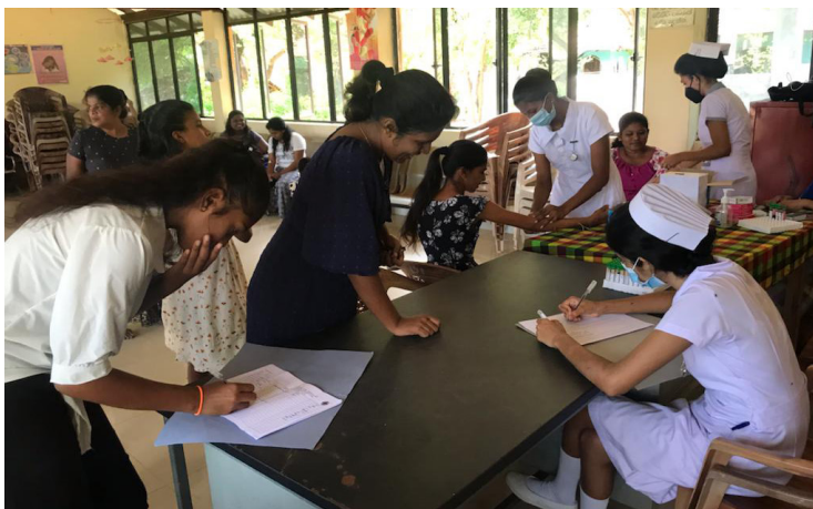
Blood screening for Thalassemia

Manmade and natural disasters are mitigated through effective program implementation. In some parts of Sri Lanka, where the impact of disasters on the community is comparatively high, the DRRM unit has adopted a systematic approach to identify, assess and reduce the risks of disasters in collaboration with the communities of the diocesan network. Reducing risk requires identifying and reducing the underlying drivers of risk, which are particularly related to poor economic conditions, degrading natural environments, poverty and inequality and climate change, which creates and worsens conditions of hazard, exposure and vulnerability. The DRRM unit has strived to lessen the adverse effects of hazards through activities of prevention, mitigation, and preparedness initiatives.